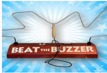
Beat the Buzzer