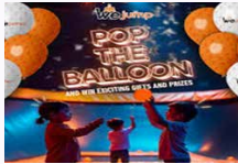
Burst the Balloon