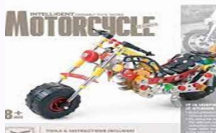
Assemble the Motorbike